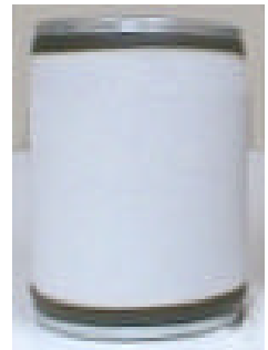
.3 Micron Particulate Filter

Since 1985, electrocorp has designed and manufactured industrial air scrubbers for clients such as the U.S. Navy, U.S. Army Corps of Engineers, Boeing, Dupont, and hospitals including Chicago General, Downtown New York Medical Center and Kaiser Permanente. Now we are able to bring these identical air cleaning capabilities into your home or small office. The electrocorp RAP-8 Air Scrubber is truly a dynamo. Use it in your kitchen, child's room, living room, bedroom or small office.