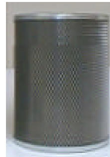
Carbon Media Filter Odor Control